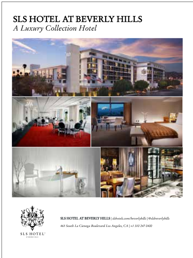
Two sided Fact Sheet